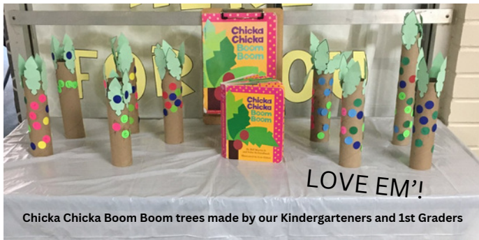
Chicka Chicka Boom Boom trees made by our Kindergarteners and 1st Graders

This program is designed to give you practical skills that can be used immediately! Classes will be held on Mondays starting 10-16-2023 and ending 11/20/2023 at St. Paul School meeting room from 6:00 – 7:30 PM. Cost is $20 per family. Questions? 989-725-8037. Please register by calling or completing a form in the school office!